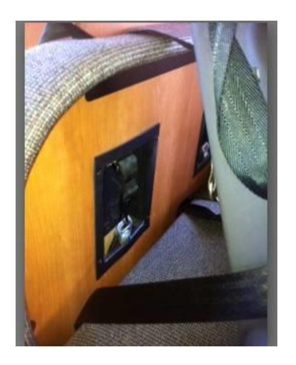
4) Top tether attached to lower anchor