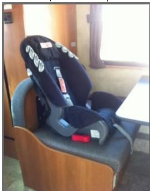
5) Child seat fully installed and cinched tightly