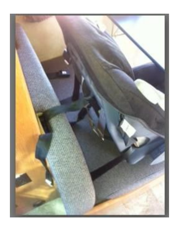
3) Child seat being installed. Tether and lap belt attached (but not cinched)