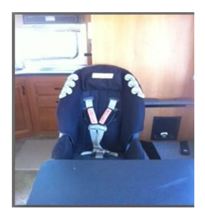
7) View of child seat from opposite side of dinette