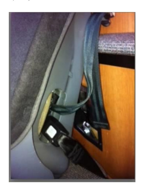
6) Lap belt secured